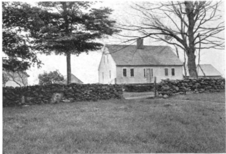
HOME OF THE FORSYTH FAMILY, SALEM, NEW LONDON COUNTY, CONN.